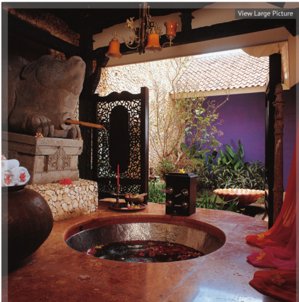
Take a bath: The unique yet romantic bathroom at Tugu Hotel Malang's Apsara Suite.