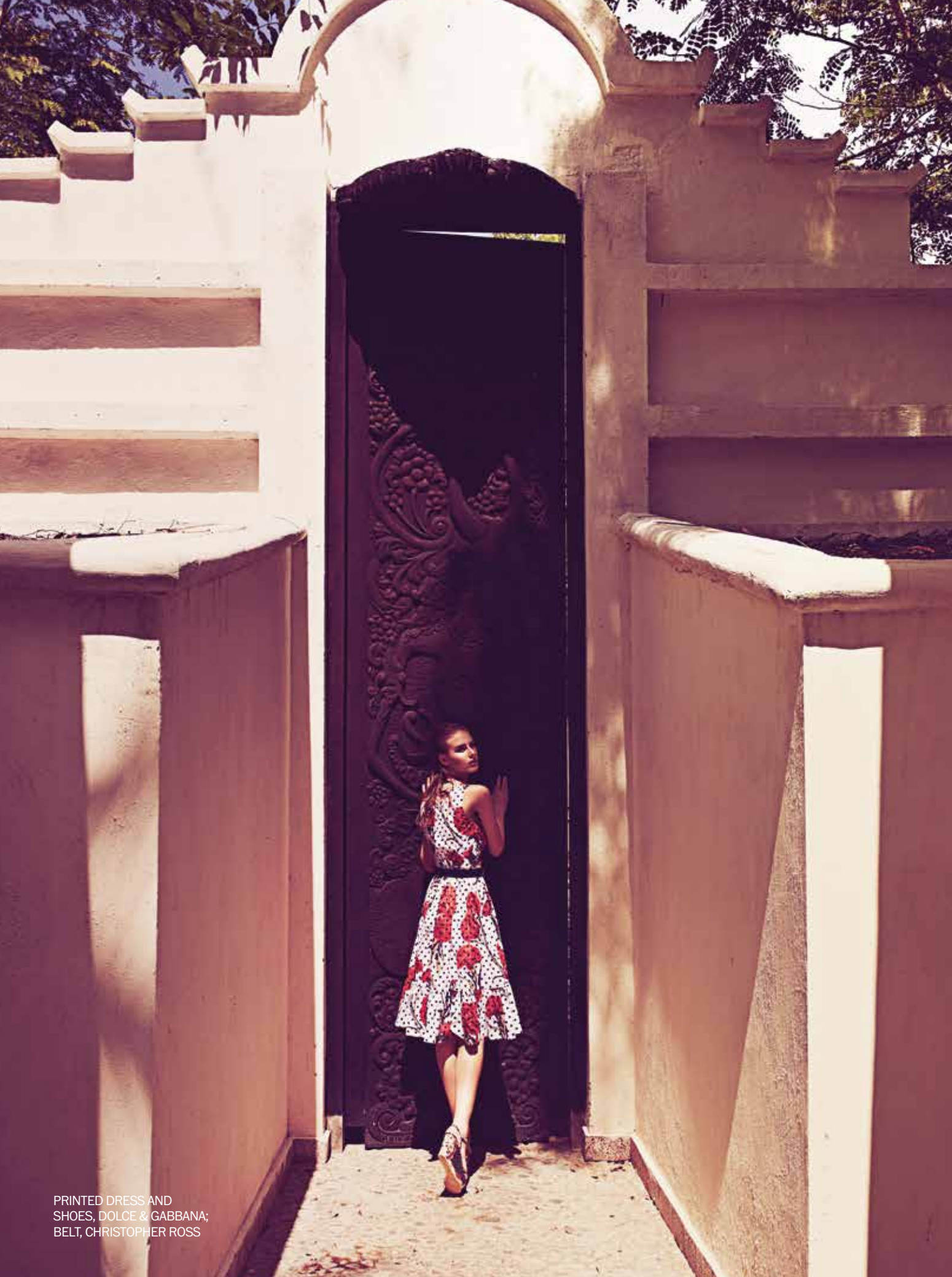
PRINTED DRESS AND SHOES, DOLCE & GABBANA; BELT, CHRISTOPHER ROSS