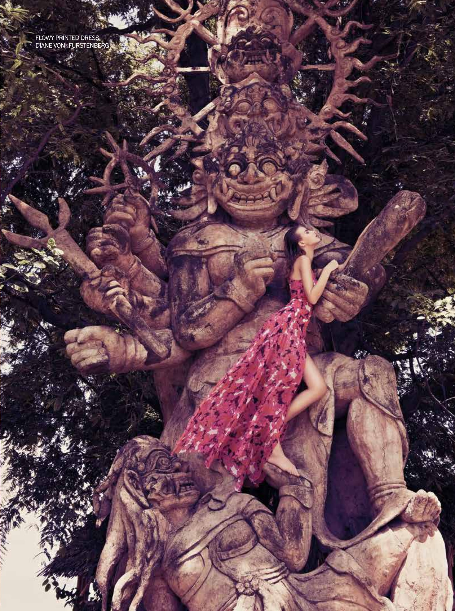
FLOWY PRINTED DRESS, DIANE VON FURSTENBERG