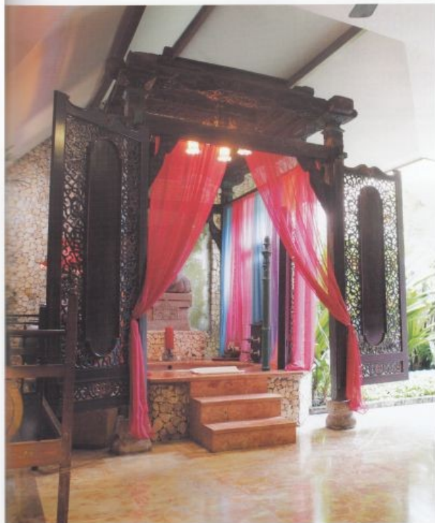
Hotel Tugu Malang, INDONESIA IMAGE | Sharm